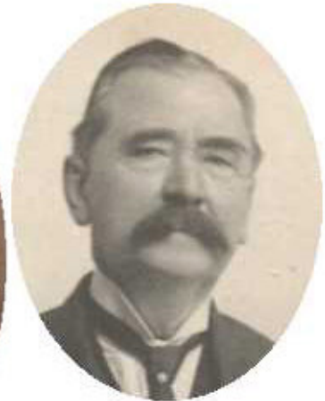
Above, 1908. Others undated.